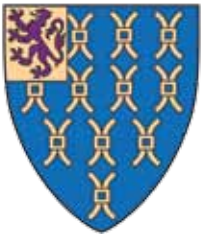
Lincoln's Inn www.lincolnsinn.org.uk

This brochure has been produced in association with the four Inns of Court