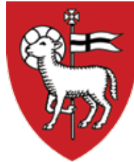
Middle Temple www.middletemple.org.uk